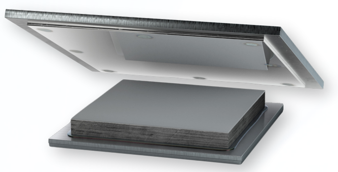
SBX TYPF BFARING

SBX Structural Expansion Bearings are used when construction tolerances, high load and rotation are prominent with beam spans being excessive. This bearing is the most resilient in our full line of expansion bearings. Ideal applications include bridges and complex structures (i.e. buildings that may be susceptible to vortex shedding).